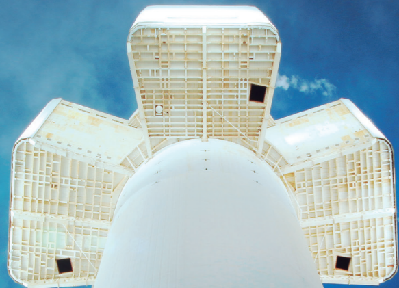
Abengoa is a leader in the development and construction of solar thermal power plants worldwide.

Electrical and electronic products for the aerospace and defense sectors, as well as the promotion of synergies between space technologies and energy.