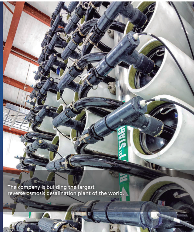
The company is building the largest reverse osmosis desalination plant of the world.