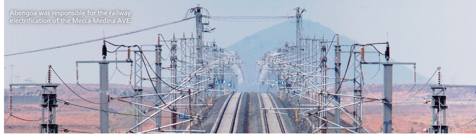
Abengoa was responsible for the railway electrification of the Mecca-Medina AVE.

It is at the forefront of hydraulic initiatives with public and private institutions, for the implementation, improvement and exploitation of regulatory infrastructures, transport (+1,100 km of large pipelines), distribution (+4 M of people served), irrigation (+500,000 ha) and hydroelectric plants (+400 MW installed in more than 40 projects).