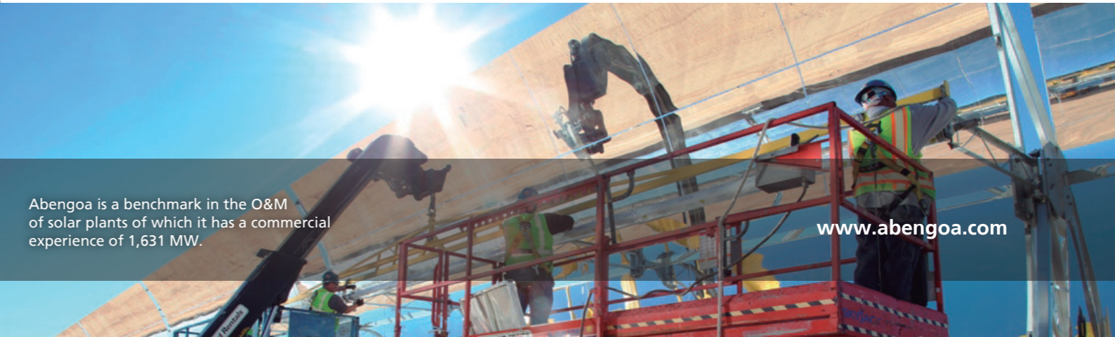
Abengoa is a benchmark in the O&M of solar plants of which it has a commercial experience of 1,631 MW.