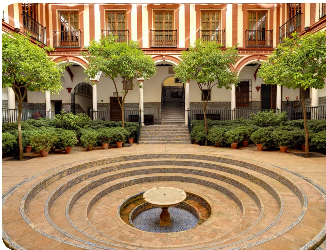
Hospital de Los Venerables: Focus-Abengoa Foundation headquarters.

Through the Focus-Abengoa Foundation, the organization guides its strategic lines towards value generation within the geographic locations of its operations. The goals of activities undertaken by the foundation, 30 years from its creation, is to better the living conditions of the most underprivileged through social development, education, local engagement, scientific and cultural research and information on the heritage of the foundation, from human and technology perspective.