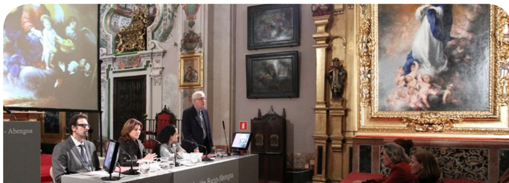
Inauguration of the 2012 Baroque School.