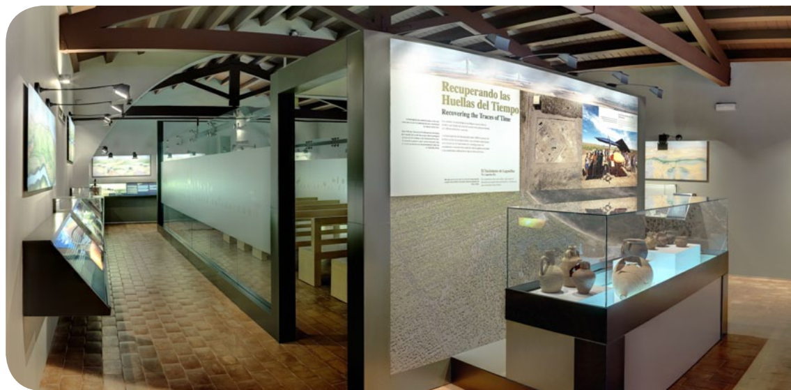
The Focus-Abengoa Campus Show room.

This protected landscape was created by recovering the land affected by the toxic mine tailings that were released due to the holding dam collapsed at the Aznalcóllar mine in Seville in 1998.