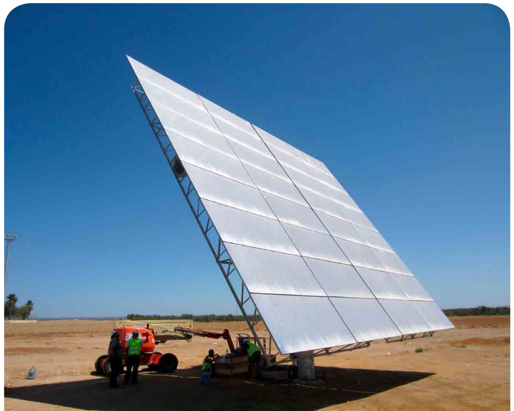
ASUP 140 heliostat