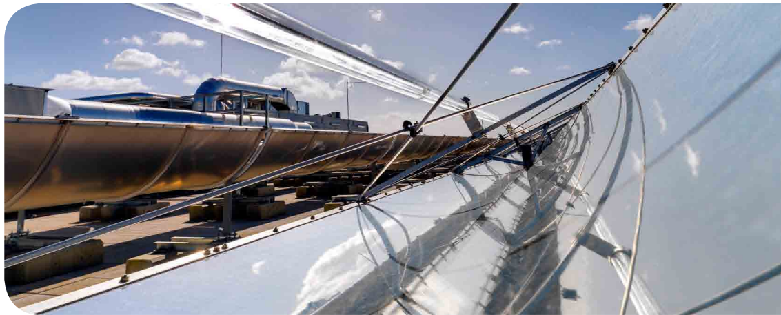
Industrial parabolic trough

Turning our attention to operation and maintenance equipment, Abengoa supplied roughly 20 Condor reflectometers to different plants within Spain and abroad, while also carrying out a technology transfer to the Spanish National Center for Renewable Energies (CENER) and another to the National Renewable Energy Laboratory (NREL) in the United States. Ten mirror cleaning vehicles were also sold to various parabolic trough plants.