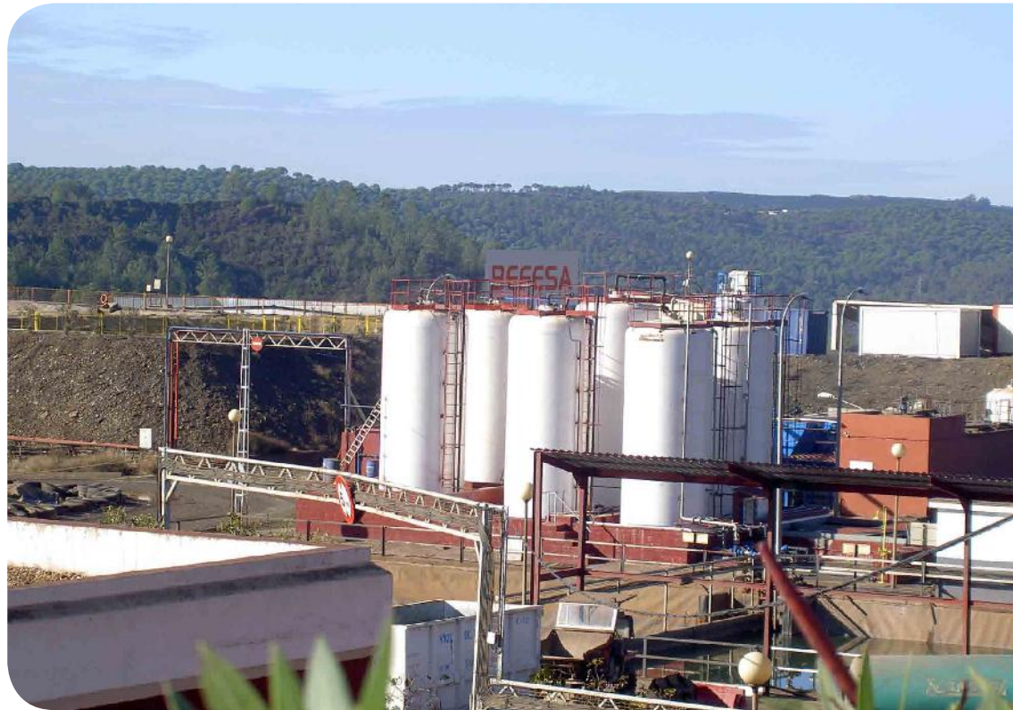
Industrial waste management facilities at Nerva (Spain)