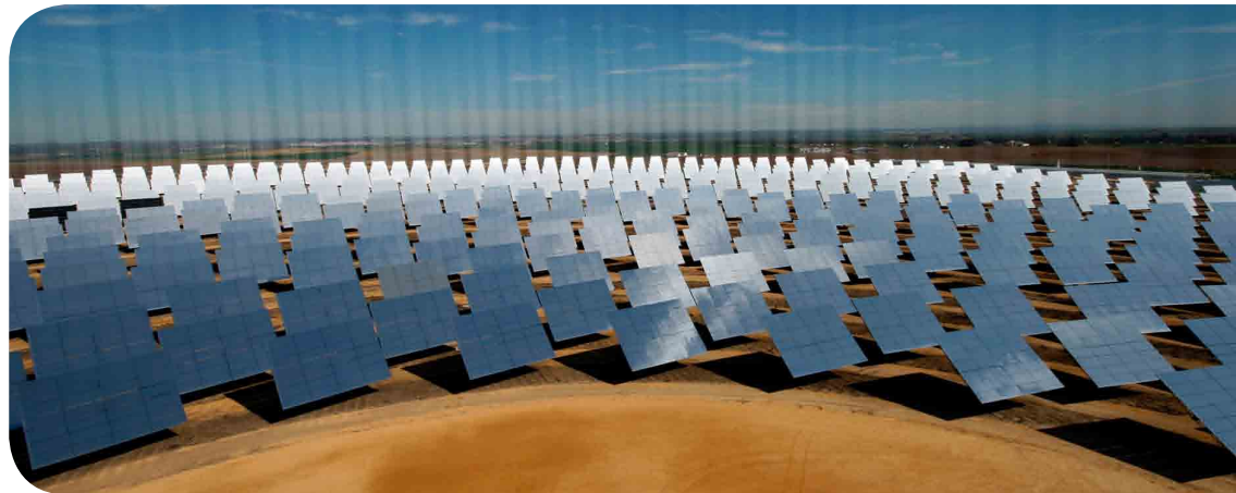
PS20 heliostat field

Abengoa market leadership should enable us to offer the most competitive prices for solar power generation via our projects, while helping us to monetize investments in R&D+i by harnessing the growth of third-party businesses.