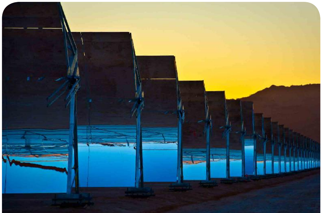
E2 trough in place at the Solana solar field