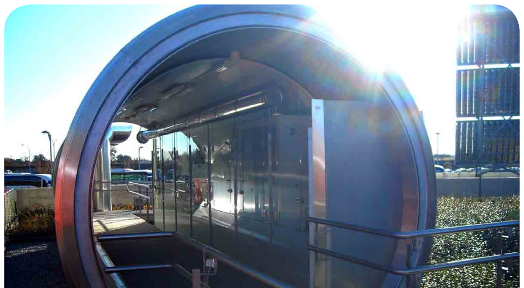
Fuel cell and hydrogen facility at Campus Palmas Altas (Seville)

Among the main projects for clients, we would highlight the developments made to the air-independent propulsion (AIP) system of the S-80 submarine, which the Spanish shipyard Navantia is developing for the Spanish Navy. Among the company's self-funded R&D projects, we would single out Procyon, which was started in 2012 with the aim of developing a 300 kV stationary cogeneration plant employing high-temperature fuel cells (molten carbonates), which will be built at Campus Palmas Altas, Abengoa's headquarters in Seville.