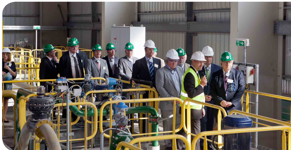
Unveiling of the new Waelz oxide leaching plant at Gravelines (France)

The steel waste recycling division witnessed numerous milestones over the course of the year. In May 2012, the company's Waelz oxide leaching plant at Gravelines (France) entered into operation. The facility has been designed with a nominal treatment capacity of 100,000 t/year, enough to meet the future leaching needs for the Waelz oxide produced by plants in Germany and France.