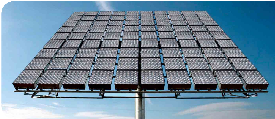
New generation HCPV tracker

Included below are the key industrial production figures for 2012: