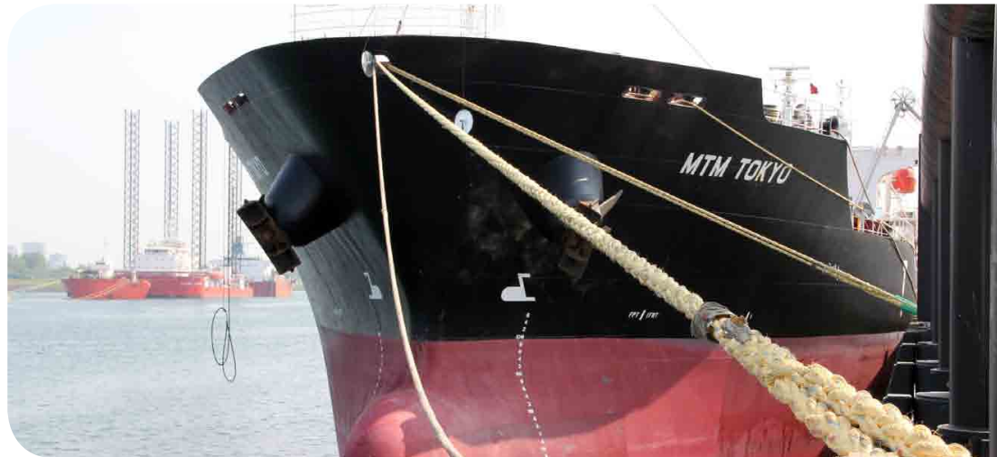
Tokyo - ship exporting bioethanol from Europe

With a view to using new raw materials as sources of carbon, the company's efforts focus on enzymatic hydrolysis and catalysis processes.