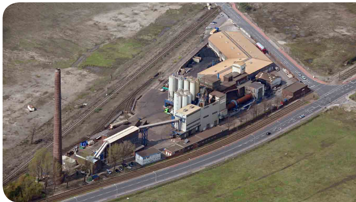
Aerial view of Abengoa facilities at Duisburg (Germany)

From this volume the company obtained more than 188,314 t of Waelz oxide, very much on par with the amount produced in 2011. In tandem, the stainless steel dust recycling plants produced more than 61,882 t of nickel, chrome and other alloys, 56.6 % up on the figure for 2011.