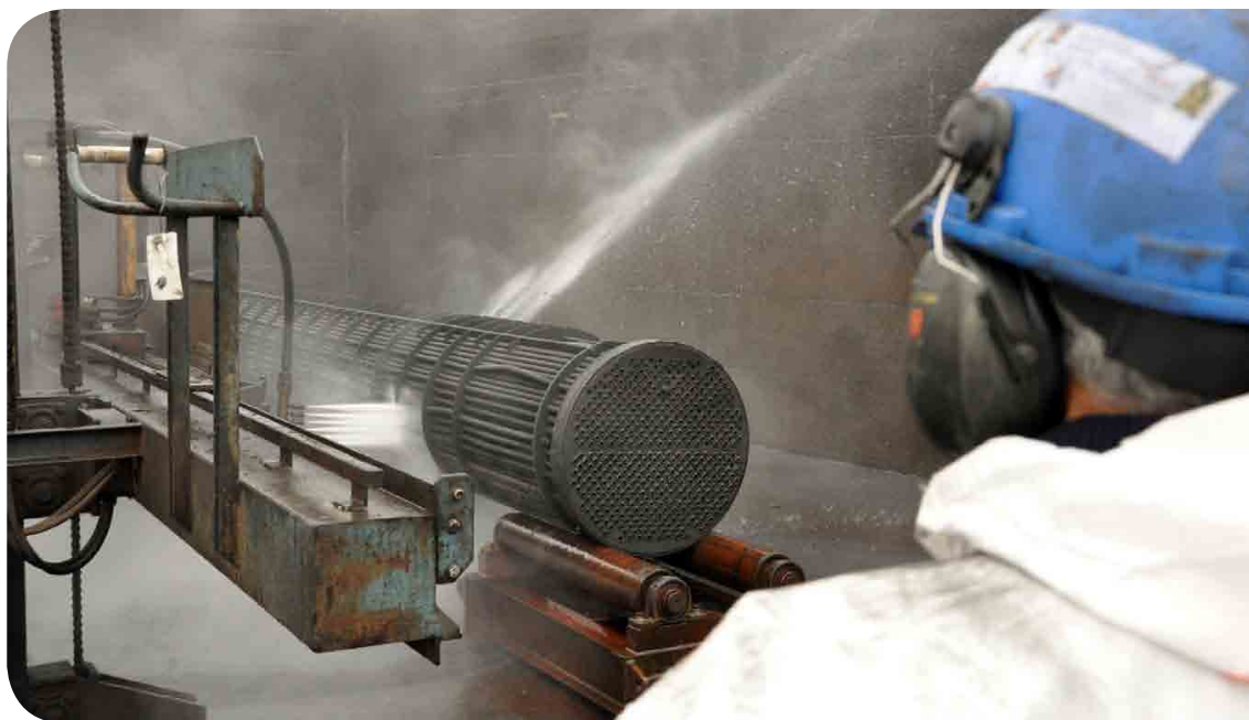
On-site cleaning of heat exchangers

The sulfur valorization business processed 58,941 t of sulfur over the year, producing 177,520 t of sulfuric acid.