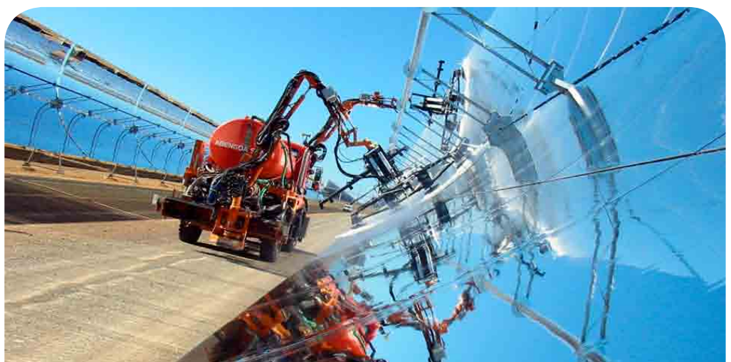
Parabolic trough cleaning truck