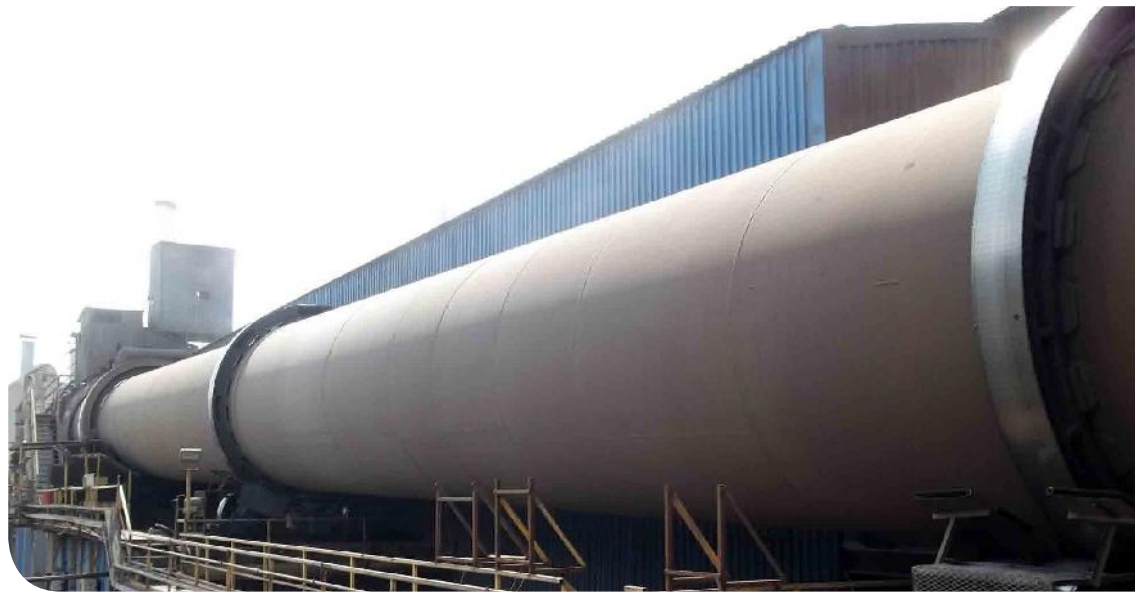
Waelz furnace at Abengoa facilities in Iskenderun (Turkey)

As part of this growth strategy, an agreement was reached in September 2012 to acquire 55 % of the South Korean company Hankook R&M Co. Ltd. (HRM), which specializes in steel dust recycling. The company is constructing a plant in the city of Gyeongju, in the south-east of the country, with sufficient capacity to treat 110,000 t of steel dust produced by the main steel mills operating in the region. The new plant, which is scheduled to commence operations in the first quarter of 2013, will be operated by Abengoa and will feature technology developed and patented by Abengoa.