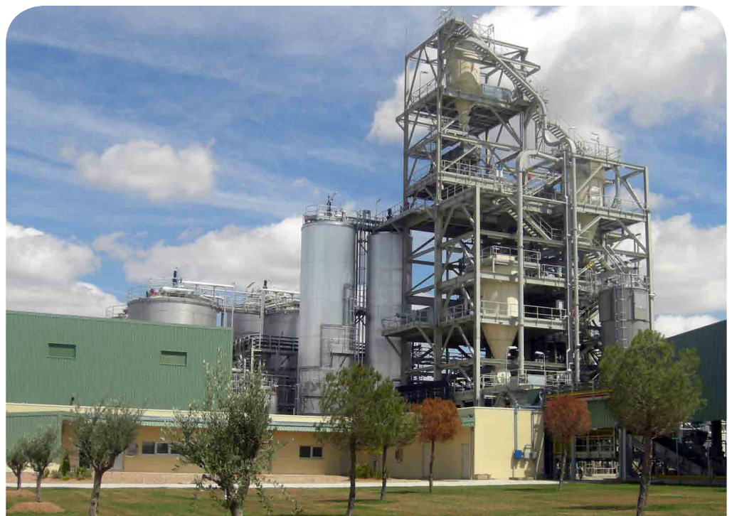
Biomass-to-ethanol demonstration plant in Babilafuente, Salamanca

In the field of catalysis, the company is working on the technology needed to convert ethanol into high value-added products, such as butanol.