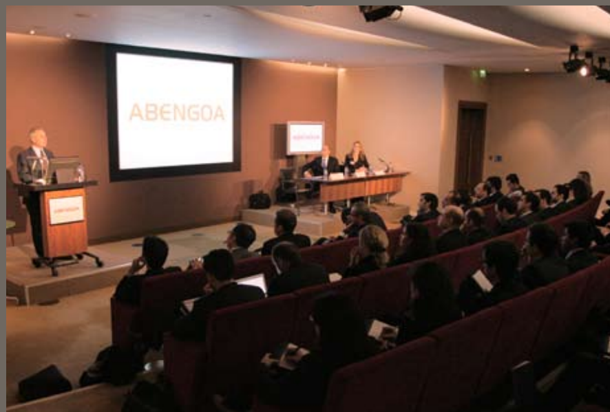
British economist Nicholas Stern, inaugurated Abengoa Investor Day in London

One of the key objectives of the Investor Relations and Reporting Department is to enable company strategy and results to be reflected directly in share price by providing clear, useful and up-to-date information.