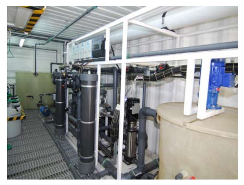
Befesa Water. High-efficiency reverse osmosis desalination pilot plant

High efficiency pilot desalination plant project. The objective is to reduce the desalination energy consumption to values below 2.5 kWh/m<sup>3</sup> of produced water. To this end, the company has conducted studies and developed the reverse osmosis membranes and energy recovery systems. Enhancements have also been made to the process to minimize energy consumption. The project has received grants from the Department of Innovation, Science and Enterprise of the Regional Government of Andalucía, and from the Ministry of the Environment and Rural and Marine Affairs.