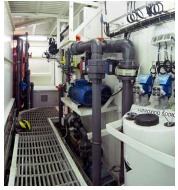
Befesa Water. Advanced pre-treatment systems pilot plant.