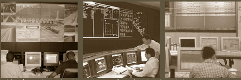
With Information Technology... we transform data into knowledge, providing effective operational and business real-time decision making for traffic, transport, energy and environment

With wastes... we produce new materials by recycling, and we also treat and desalt water to achieve a sustainable globe