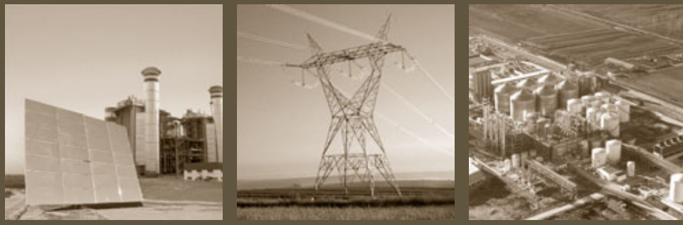
With engineering... we construct and operate conventional and renewable energy power plants, power transmission systems and industrial infrastructures